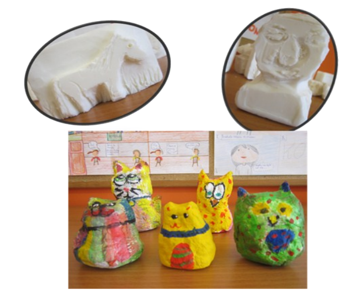
At school, during art lessons, our students

which were ran by the graduate of the School of Fine Arts. The effect of the meeting is an exhibition of great works, that can be seen in the "Erasmus Gallery" .There's also a photoreport of these workshops.